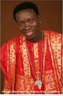
MICHAEL K. BLACKSON "THE AFRICAN KING OF COMEDY" You Modasucka!

He has been called one of the most original stand-up comics in the country, and his performances leave audiences laughing in tears. Michael Blackson, aka, 'The African King of Comedy', has been entertaining audiences all across the country and around the globe for more than a decade. Inspired by the stand up comedy of Eddie Murphy, Michael began to develop his comedic talent in 1992 in the unkind comedy clubs of Philadelphia, Pennsylvania. Michael's comedic appeal grew from his involvement with BET's Comicview series, HBO's Def Comedy Jam, Showtime at Harlem, and Live in Hollywood.